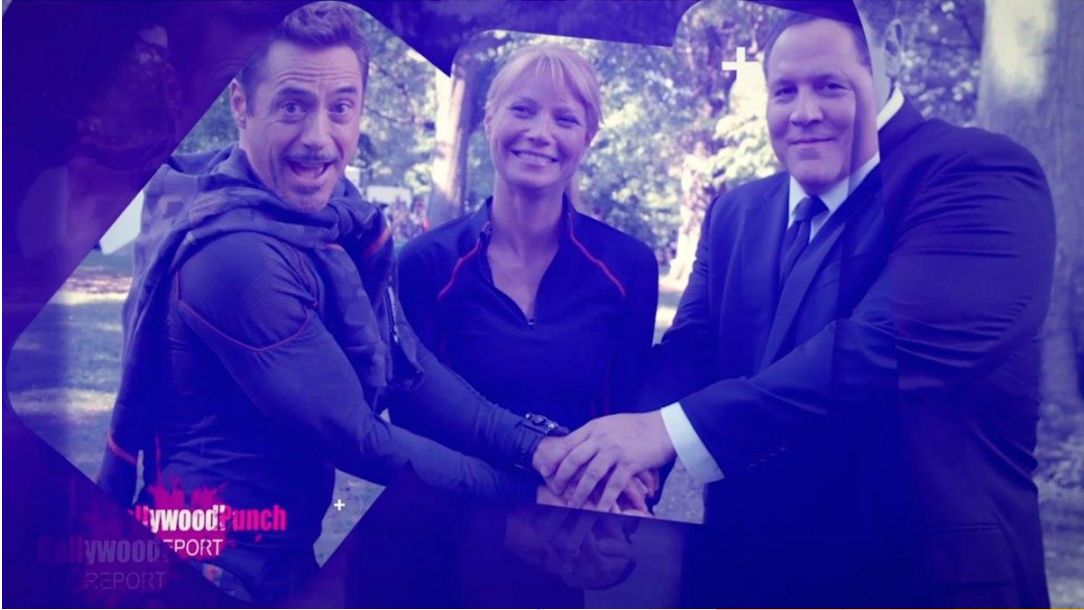
According to Nielsen Ratings